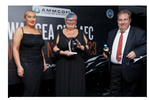
What an honour to have been awarded the Community Champion award by the Swans for all the work with Everyone Deserves