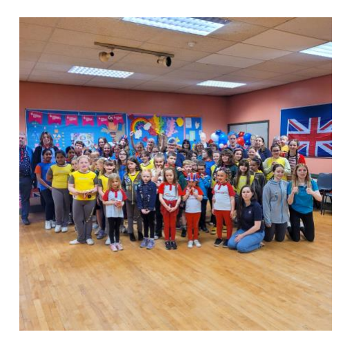
Look at all those happy faces at Cwmbwrla Brownies' coronation celebration!