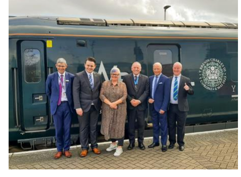
Lovely to see the GWR carriage honouring His Majesty

The Cwmbwrla Brownies put on a lovely celebration, with other uniformed groups from across the city in attendance, that was full of fun. There were amazing events at Jersey Park Pavilion and St John's Day Centre, and it a pleasure to see GWR commemorate the King's service as Prince of Wales with a newly decorated carriage in his honour. God save the King!