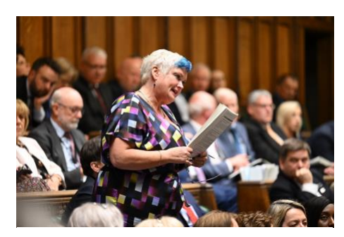
Getting into the PMQs spirit

Straight after that, I had the privilege to enlighten the Prime Minister at PMQs of how his Government's catastrophic economic mismanagement is affecting families in Swansea East. I told him all about the good work Faith In Families does in our community. I also relayed stories they had told me, of children going to school in shoes that don't fit them or having to have water on their cornflakes because mum can't afford the milk. I asked the Prime Minister whether he was worried about these kids? To which he shamefully employed his usual tactic of proudly reeling of a series of stats which weren't relevant to the question asked. He said he was proud of this and previous Conservative Government's records on poverty. I don't know what universe he is living in!