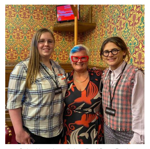
So inspiring to hear all about Equal Power Equal Voices mentoring programme