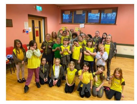
Cwmbwrla Brownies enjoying their crème eggs

The day before Easter Friday the sun was shining and we were up early at Pentrehafod School, getting everything ready to pack hampers in the sports hall. It was a lovely atmosphere as teams of helpers from across our community were in Easter spirits.