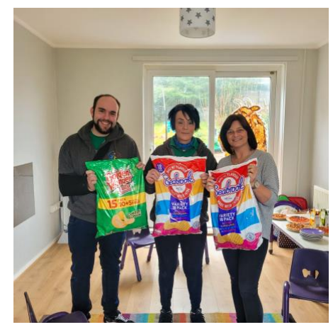
Lovely to drop off some treats to Faith in Families