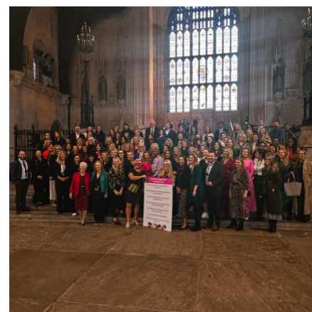
Thrilled to see so many politicians, experts, campaigners and members of the public support our campaign

There was tremendous support from colleagues across the House coming together in support for the recommendations and making the argument that the Government should stop paying lip service to women's health. Day-in-day-out I hear stories from women who can't get a diagnosis from their GP, who can't get HRT due to a lack of supply, who have left their jobs due to a lack of support, or who simply don't know where to turn for help. Only 14% of the 13 million menopausal women in the UK are getting treatment. That's 13 million voters who feel let down and if the Government won't listen to them, I know others who will, so watch this space!